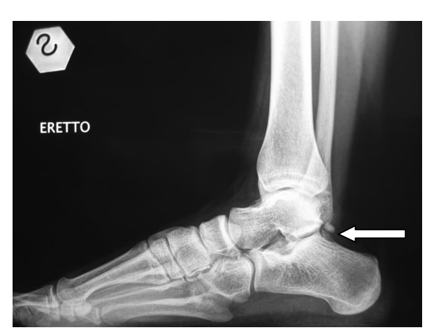
Figure 1: Note the presence of os trigonum.