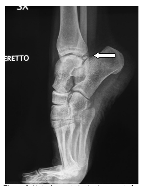
Figure 2: Note the posterior impingement of os trigonum during releve.